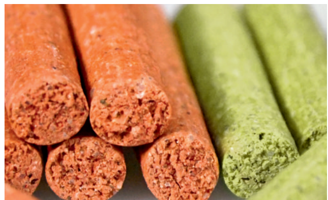
ARBOCEL® for extrusion process

Building on experience in virtually every industry sectors, JRS Plant Fiber Agents have proven to be true solution providers in extrusion!